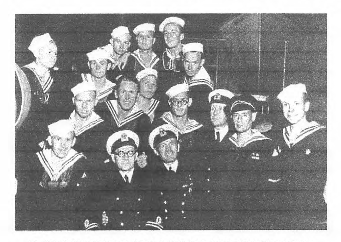
Maritime Days in Tallinn on June 5-6, 1937. From KGB's point of view, Marine Scouts was a fascist youth organisation