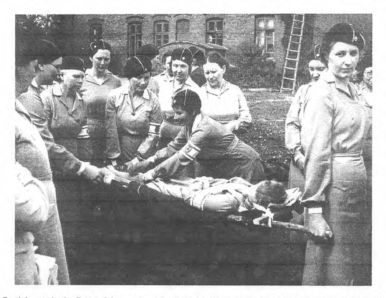
Participants in the first training camp of the Estonian Women's Defence League Auxiliary Corps in Viljandi County, June 8-10, 1939. Participation in such training camps was regarded as active counterrevolutionary activity punishable under article 58 of the penal code