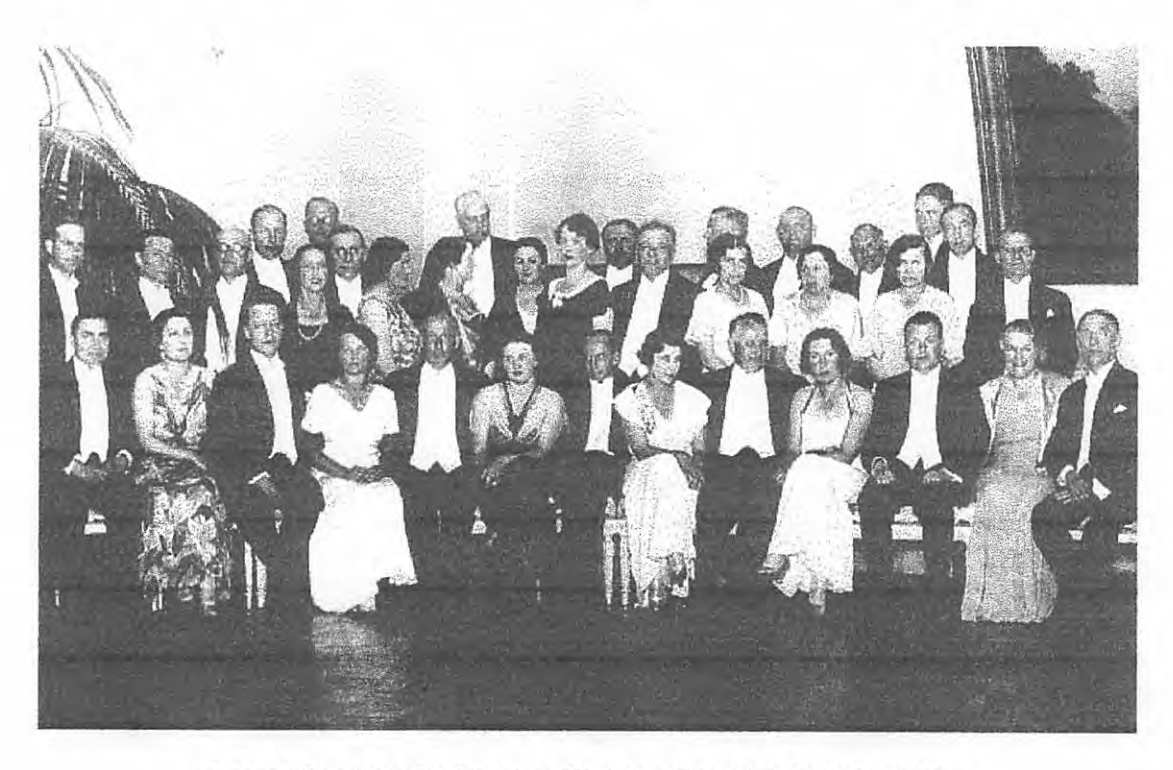
A reception held by Foreign Minister Friedrich Akel in Tallinn