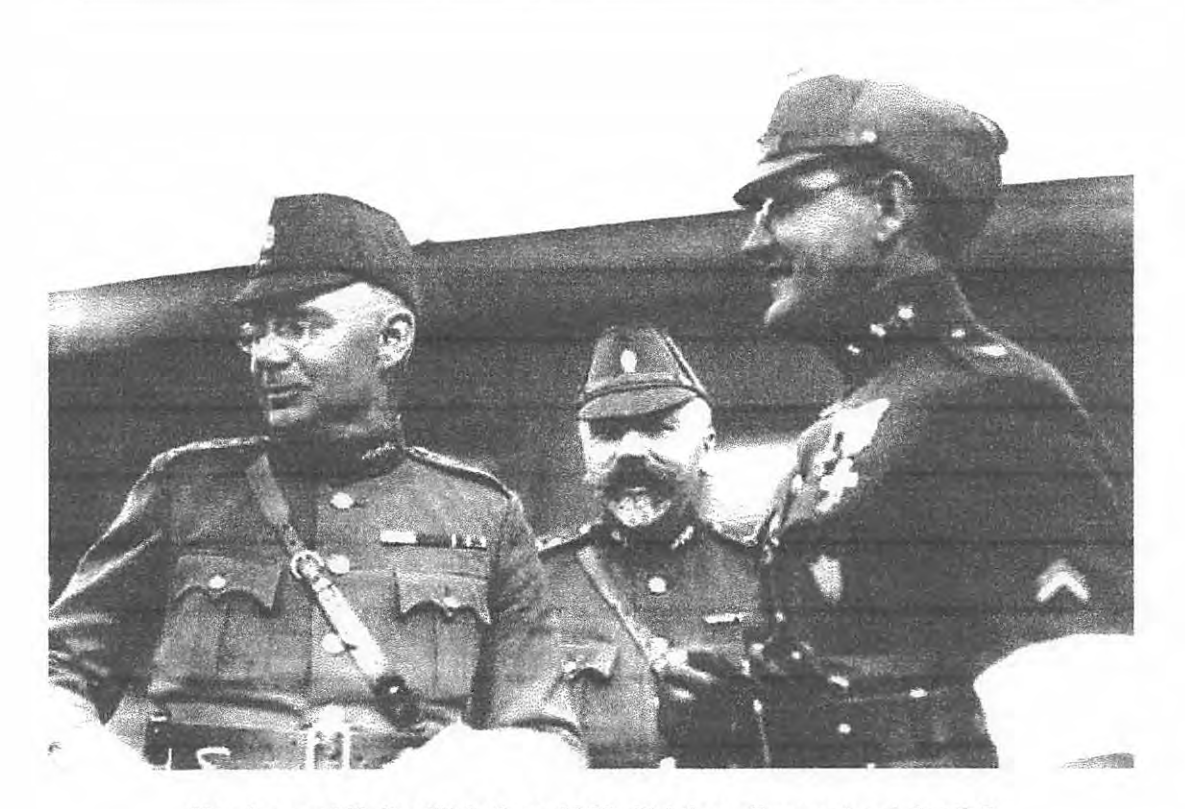
Members of Kaitseliit before 1940. Did they die a natural death?