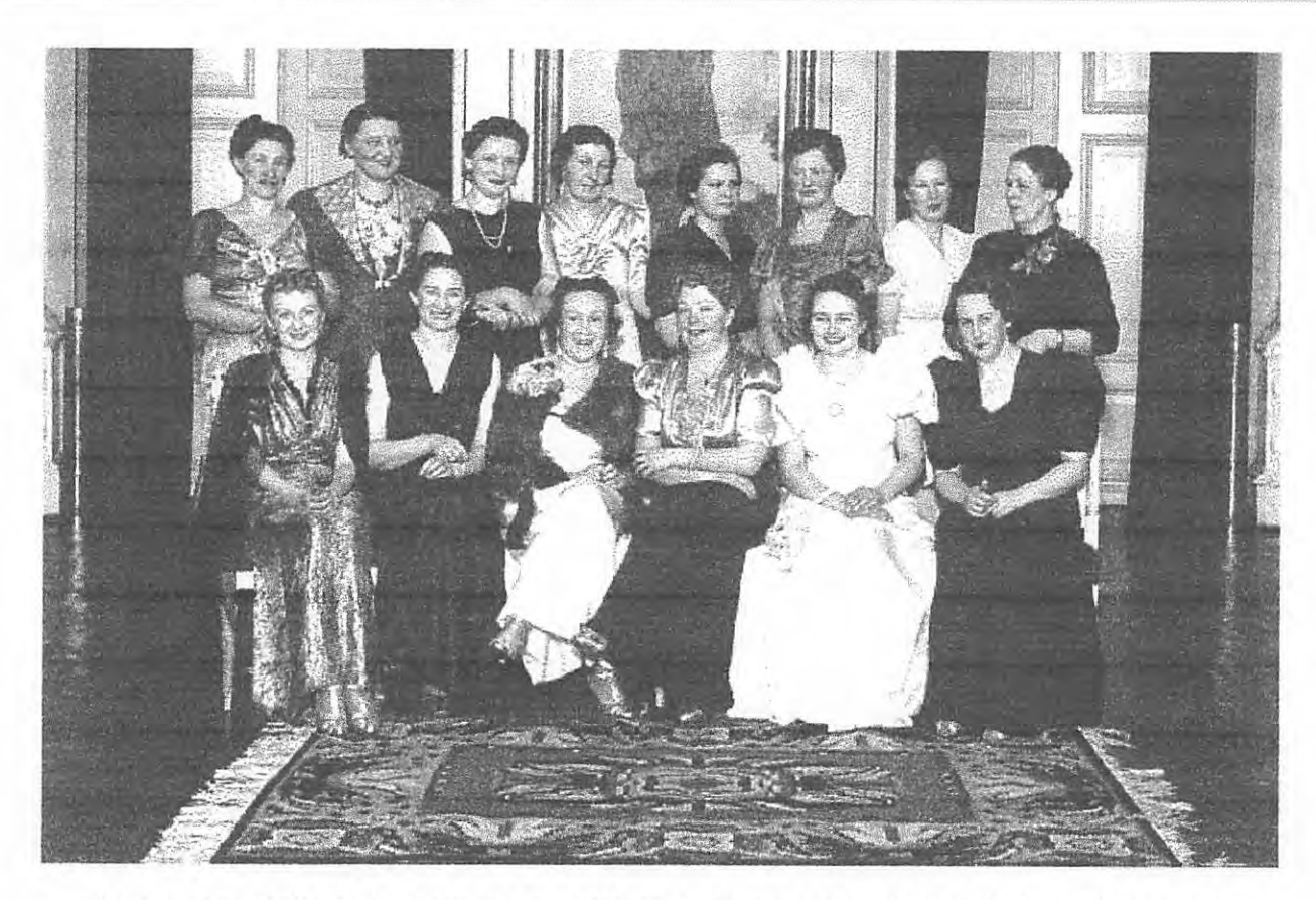
Anniversary of the Kalev battalion in 1938. The officers' wives in the photograph became widowed; some of them were deported, some fled from the red terror to the West. First row,